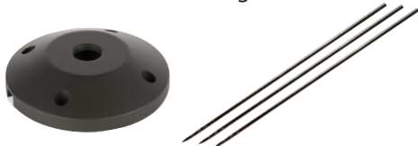
Surface Mount Flange/Stake

Includes three 7 inch threaded stainless steel stabilizing pins for ground mounting or surface mounts with four screws or over a junction box