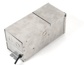
9600-TRN-SS 600W Max