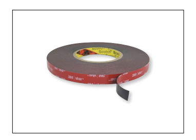
3M™ Adhesive Tape

Linking cable is used to connecto two luminaires together.