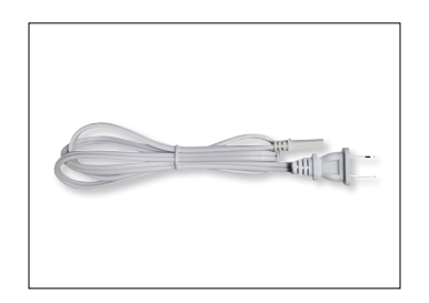
39" Cord and Plug