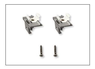
Swivel Mounting Brackets

Pair of flat mounting brackets used to mount luminaire to surface. Includes two screws. Note: (2) Brackets are included with each fixture.