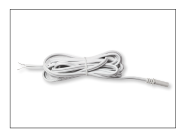
Hardwire Power Cord

39" Cord with 90^{\circ} Elbow used to connect luminaire to outlet.