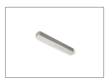
End to End Connector

Pair of Two Pair of metal plates used to mount luminaire to surface with internal magnets. Includes two screws.