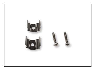
Flat Mounting Brackets

Note: (1) End cap is included with each fixture.