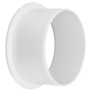
L50W - White Snoot